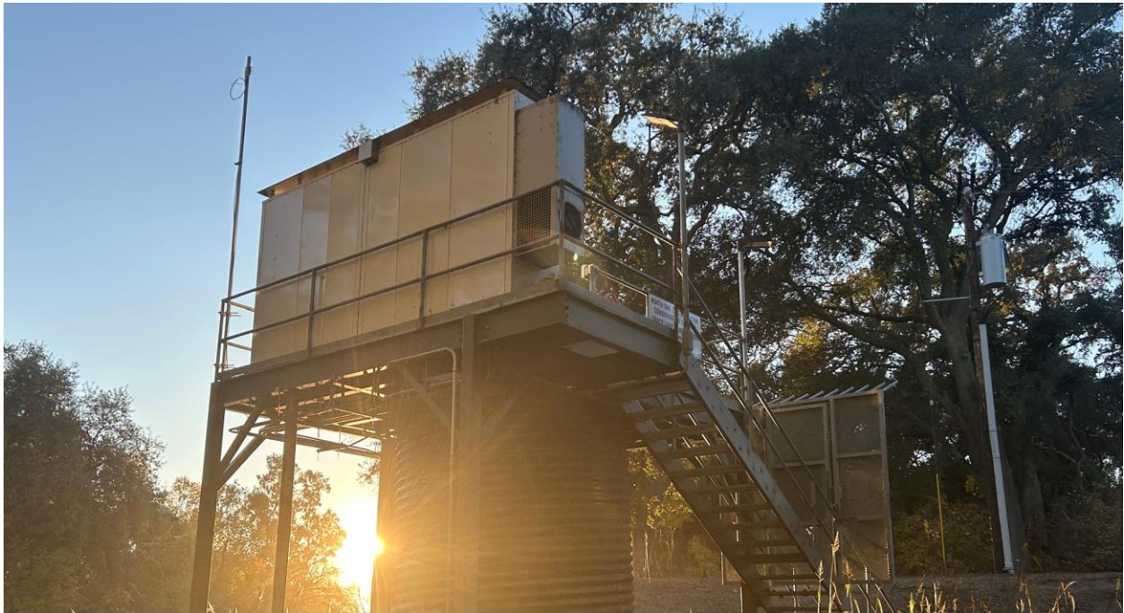
NSJWCD's Tracy Lake's Pump Station at Sunset

District Resumes Pumping and Recharge Activities: District Staff has been monitoring releases from Camanche, the Elliot Gage which appears to be repaired and reading logically again, WID Diversions and the flow below Woodbridge Dam. Based on that data we see at least 20 cfs gain below Camanche that is available for diversion under the Permit 10477 direct diversion right. The District resumed pumping and recharge activities at 3 pm Thursday, putting 2.7 CFS from the Temporary North Pump Station onto the Reynolds Recharge Project. It was a welcome opportunity to showcase and active project on our District Tour today. We expect to have the Costa property ready to take CalFed Water next week.